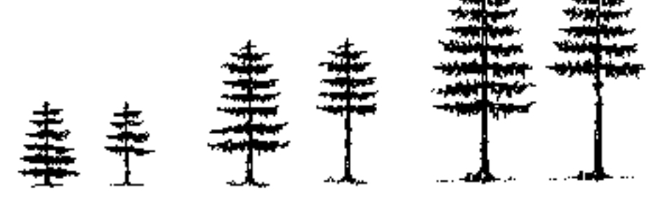
Figure 2. As the tree grows, each successive lift removes the branches below the 50 percent crown level. From Emmingham and Fitzgerald, EC 1457, Pruning to Enhance Tree and Stand Value, courtesy of Oregon State University Extension Service.

bole to be pruned should be about 4–5 inches at the time of each lift (Figure 2). General guidelines for westside Douglas-fir follow: